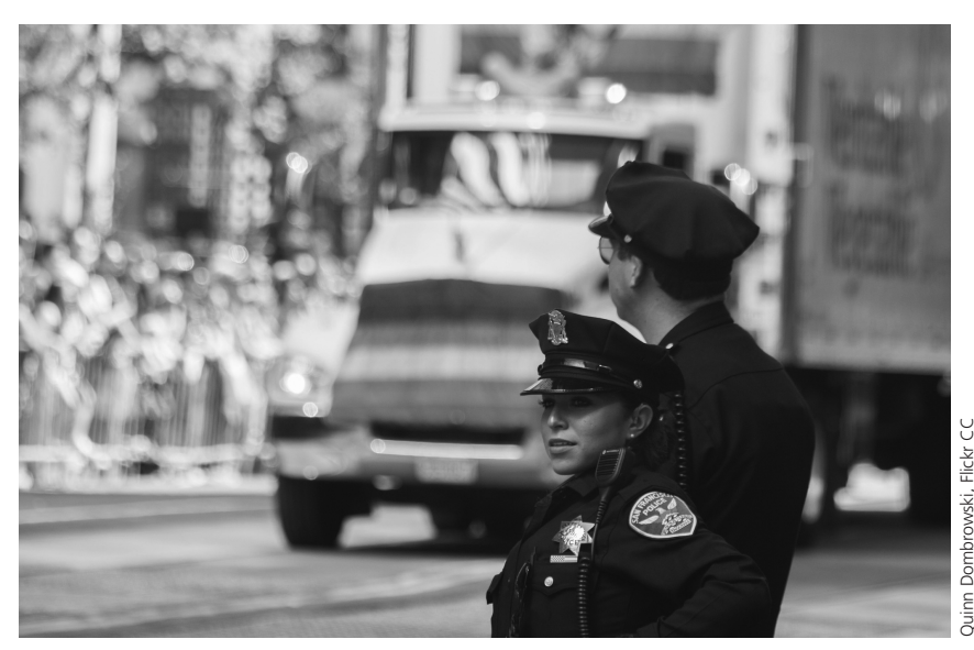
Increasingly, activists have called for barring uniformed police officers from participating in U.S. Pride events.

A growing body of research reveals that LGBTQ+ people experience criminal victimization at higher rates than the gen-